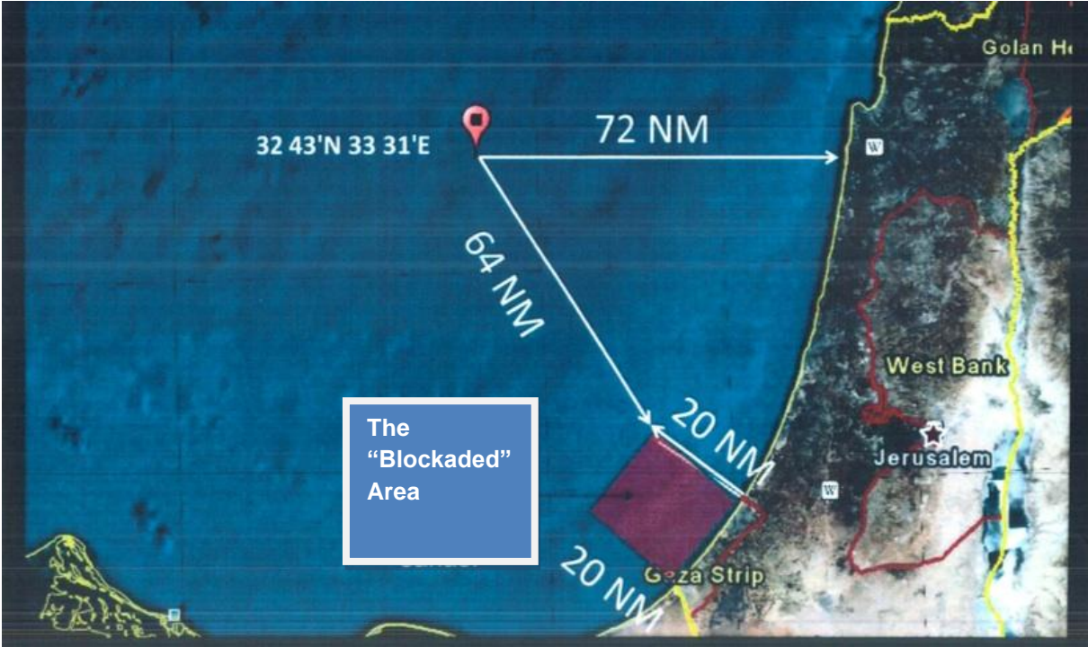
Map 1: The position of the Mavi Marmara in the moment of attack.